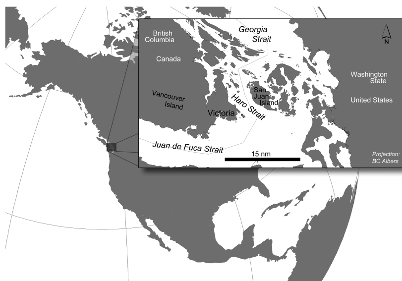
Figure 1 Map of the study area, with place names referred to in the text.